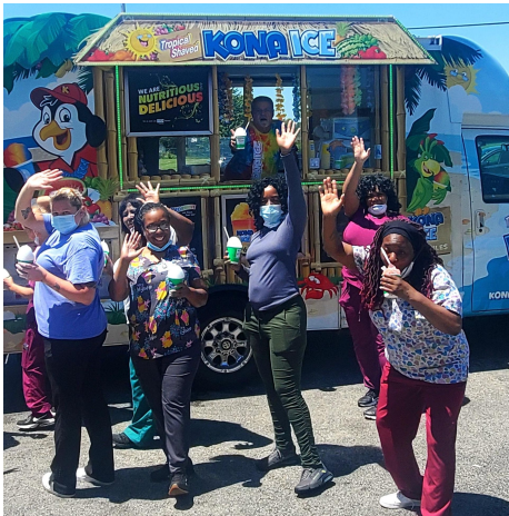
Kona Ice Truck to Celebrate CNAs!