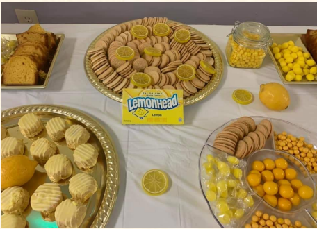
Lemon was the flavor of the day! Yellow was the color!