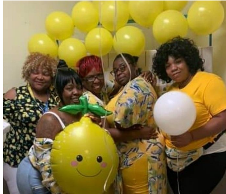
The "Lemon Gang" -