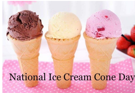
National Ice Cream Cone Day