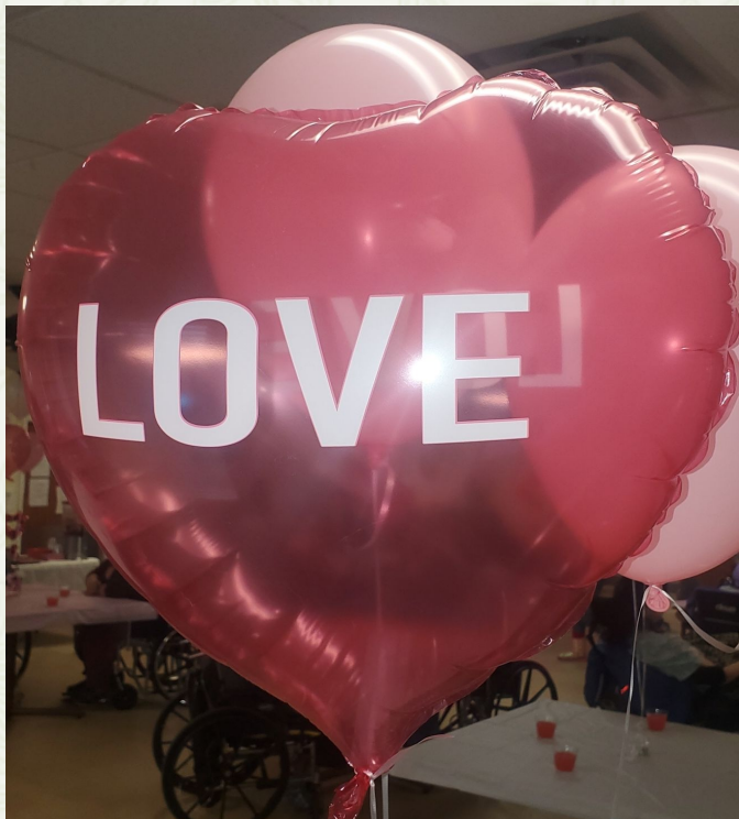
We had an amazing Valentine's Day! Love was in the air!