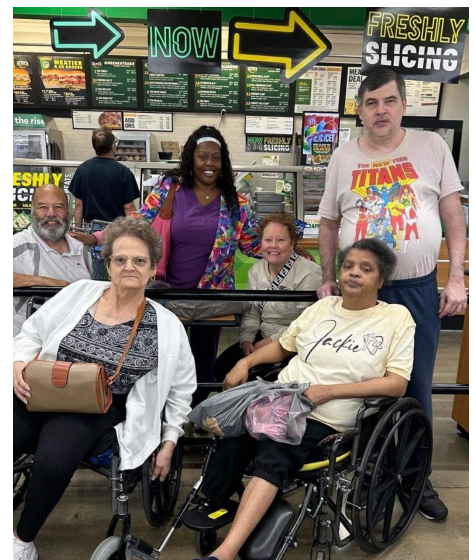
Subway and Walmart - a fun afternoon