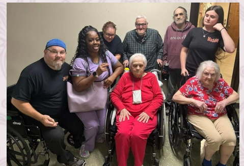
The Bingo Gang!