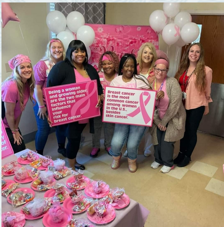
Our Pink Crew

Family & Friends Day A small group of residents enjoyed attending the John Divine MB Church Friends & Family Day. It was a wonderful service and delicious food.