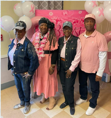
Guest Speakers at Pink Out Event