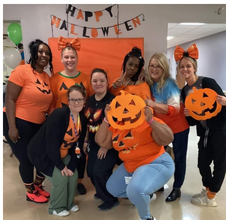
Some of our team!