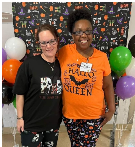
Halloween PJ Day