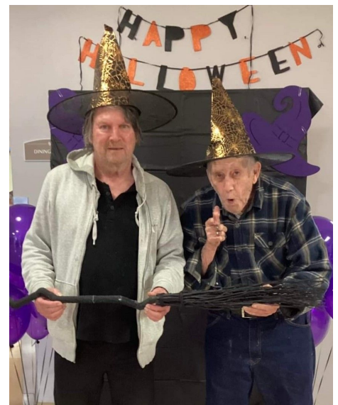
Witches or Warlocks? Who cares, we love them anyway!