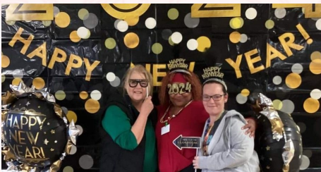
Our Leadership Team wishes everyone a great year ahead!