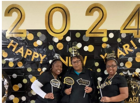
These 3 could be trouble, but we appreciate them!