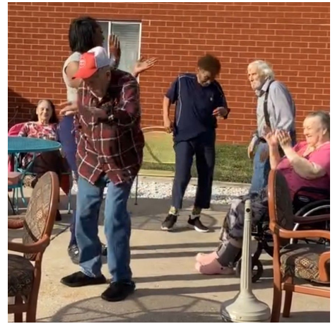
Our dance group shaking a leg!