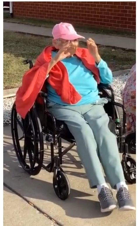
We even swayed to the music in our wheelchairs! All you need is the beat!