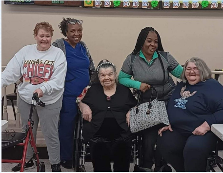
This group of ladies enjoyed a "girls' night out" at the KC Hall to play bingo.